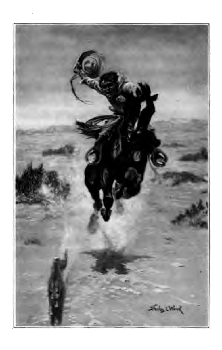
Out on the plain we saw the Kid yelling like a wild man, with Dynamite at his highest speed, chasing a jackrabbit